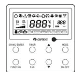
YB1FA (Standard) XK75 (Optional) XK117 (Optional)