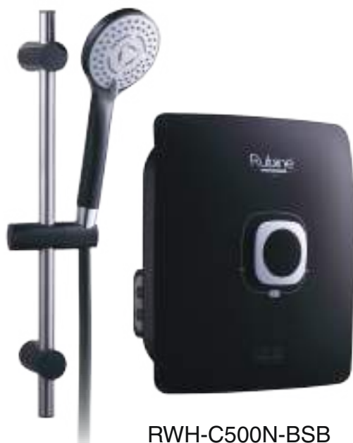
RWH-C500N-BSB RCP WM RM271 / EM RM285