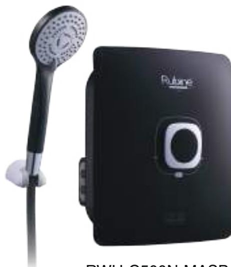
RWH-C500N-MASB RCP WM RM251 / EM RM264